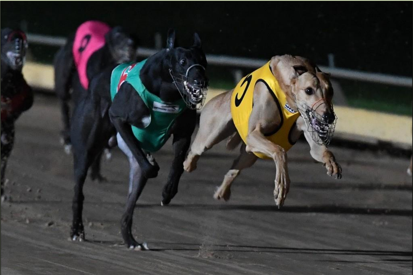
Leo's Gift leads all the way in Warrnambool Cup